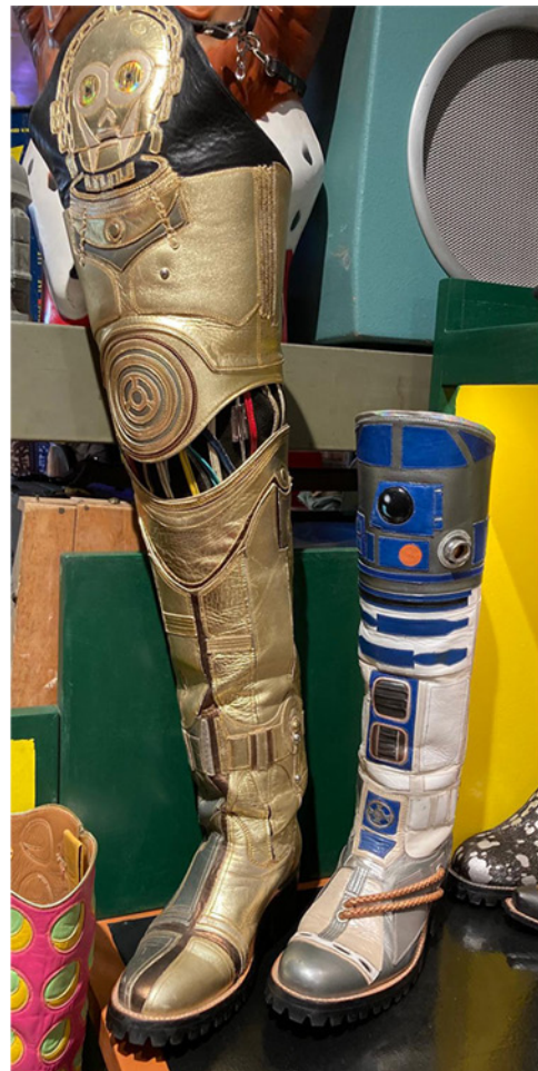
Right: In keeping with its space-themed vibe, the store displays a pair of "Star Wars" boots, featuring C3PO and R2-D2. Each pair of boots is unique.