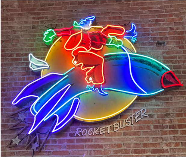
Rocketbuster Boots, in El Paso, Texas, creates hand-made custom boots, which are out of this world!

owner and her staff members were welcoming, off-beat, and generous with their time. They and their creations displayed a great sense of humor.