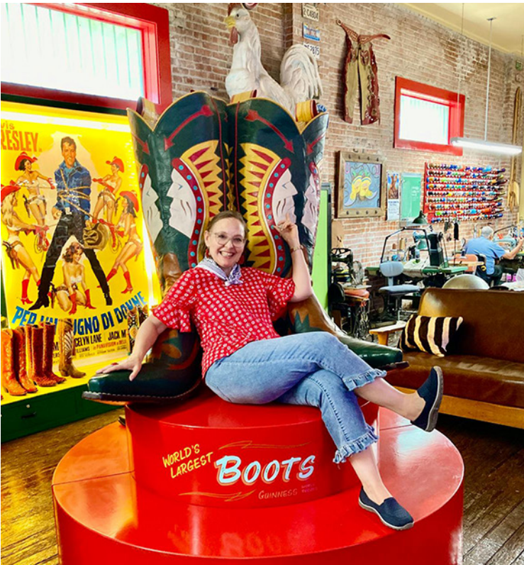
Mona poses with the world's largest pair of authentic cowboy boots. Made by Rocketbuster Boots and certified by Guinness World Records, these leather boots stand 4 feet 6 3/4 inches tall and measure 3 feet 11 inches from heel to toe.

Sometimes you don't know if the boot fits—until you try it on.